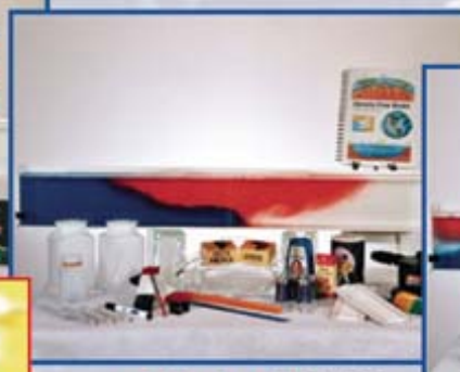
Original Model simulating an occluded front