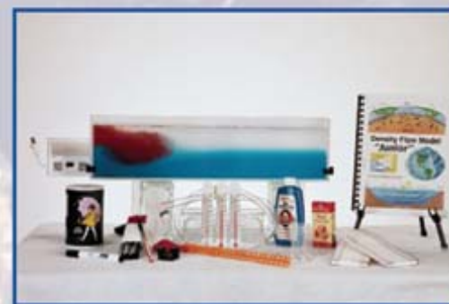
Junior Model simulating water mass migration in the ocean

Dimensions: 22" L x 6" H x 3.75" W (56 cm x 15 cm x 9.5 cm) Shipping weight: 15 lbs. (7 kg)