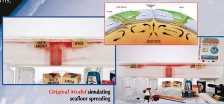
Original Model simulating seafloor spreading