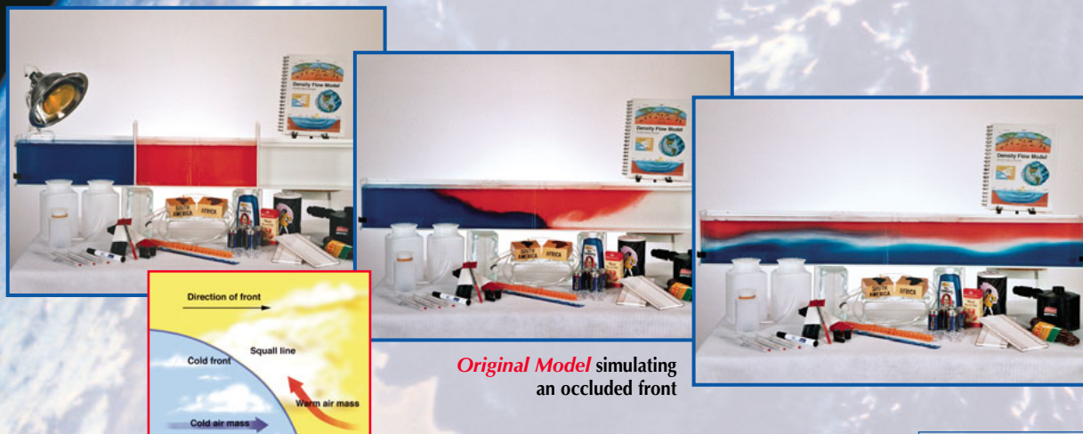
Original Model simulating an occluded front