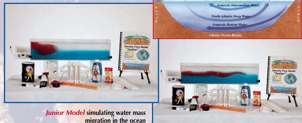
Junior Model simulating water mass migration in the ocean

Dimensions: 22" L x 6" H x 3.75" W (56 cm x 15 cm x 9.5 cm) Shipping weight: 15 lbs. (7 kg)